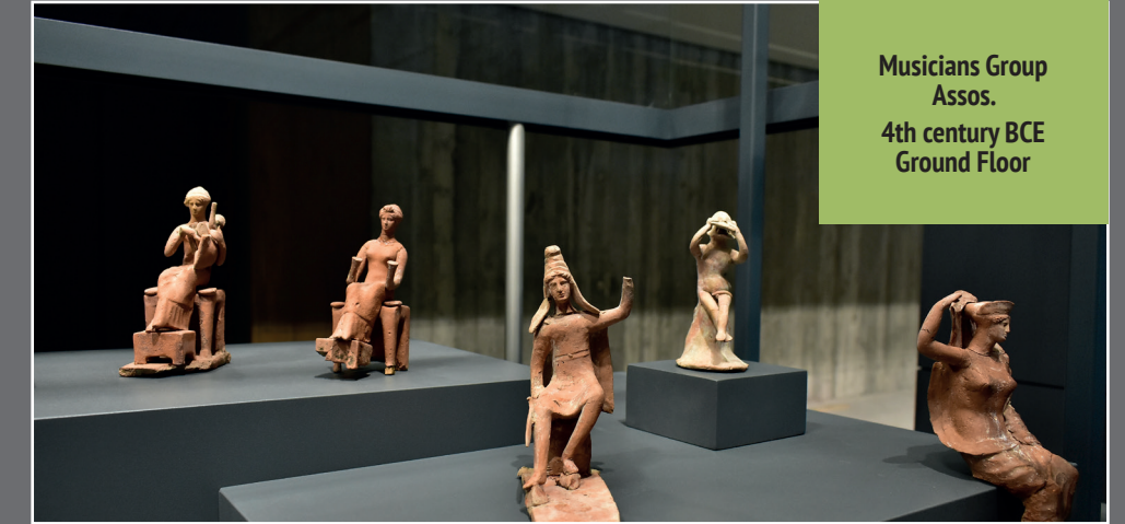
Musicians Group Assos. 4th century BCE Ground Floor

It is important because it is the oldest example of sarcophagus with figurative narration discovered in Anatolia so far. The fact that the scene of the sacrifice of Polyxena, the daughters of the famous characters of the Trojan War, King Priamos and Queen Hekabe, was included in the sarcophagus on which 37 figures were engraved, shows that the effects of this war, which is the subject of legends, have continued despite the centuries that have passed. The sarcophagus is also important in that it is the first example to cover more than one subject.