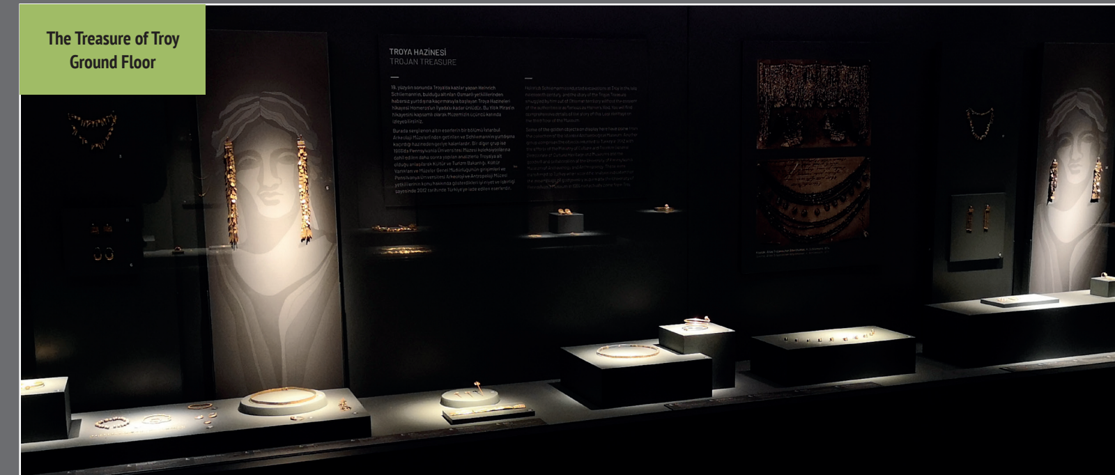
The Treasure of Troy Ground Floor

Roman emperors paid great attention to Troy because they believed that their ancestry came from Aeneas of Troy, who was also considered the grandfather of Romus and Romulus. When Hadrianus followed this tradition, he donated money for the construction of Odeon during his visit, and the people of Troy built this statue to express their gratitude.