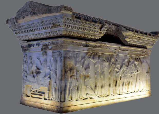
Polyxena Sarcophagus Biga, 6th Century BCE Second Floor

Considered to be one of the most beautiful of the colorful sarcophagi discovered to date, and one of the rare examples that reflects the artistic understanding of the years when Anatolia was under Persian rule, it is thought that the sarcophagus was built for a member of the dynasty who ruled in the region in those years. The physical characteristics of each figure in the scenes featuring a large group of people, and the fact that their clothes are made differently, reveal the artistic mastery in making the sarcophagus and the understanding of realism that is adhered to.