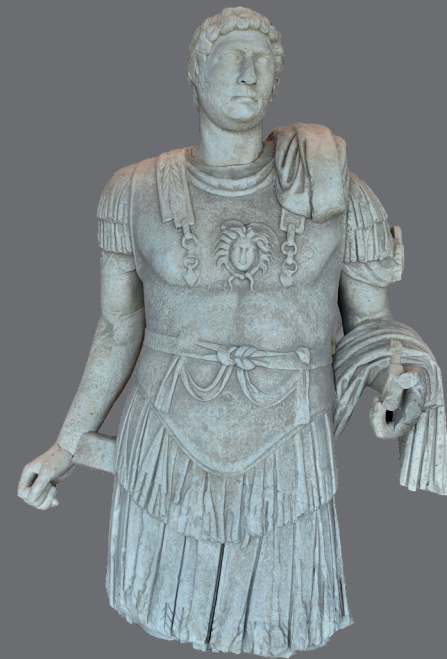
Hadrianus Statue 117-138 CE Second Floor