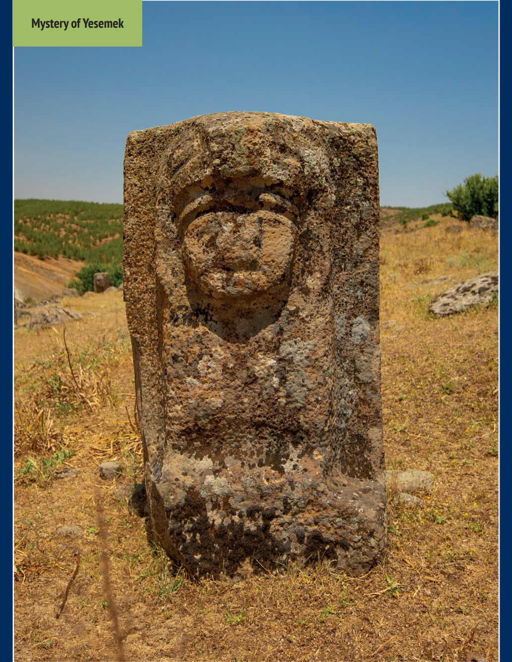
Mystery of Yesemek

The reason why the work on the quarried stones was stopped and the sculptures left in a semi-finished state is still a mystery.