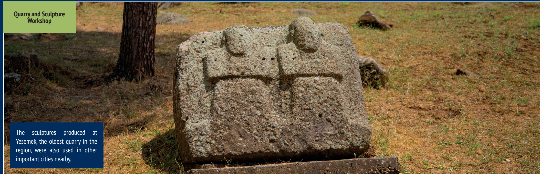
Quarry and Sculpture Workshop

The sculptures produced at Yesemek, the oldest quarry in the region, were also used in other important cities nearby.