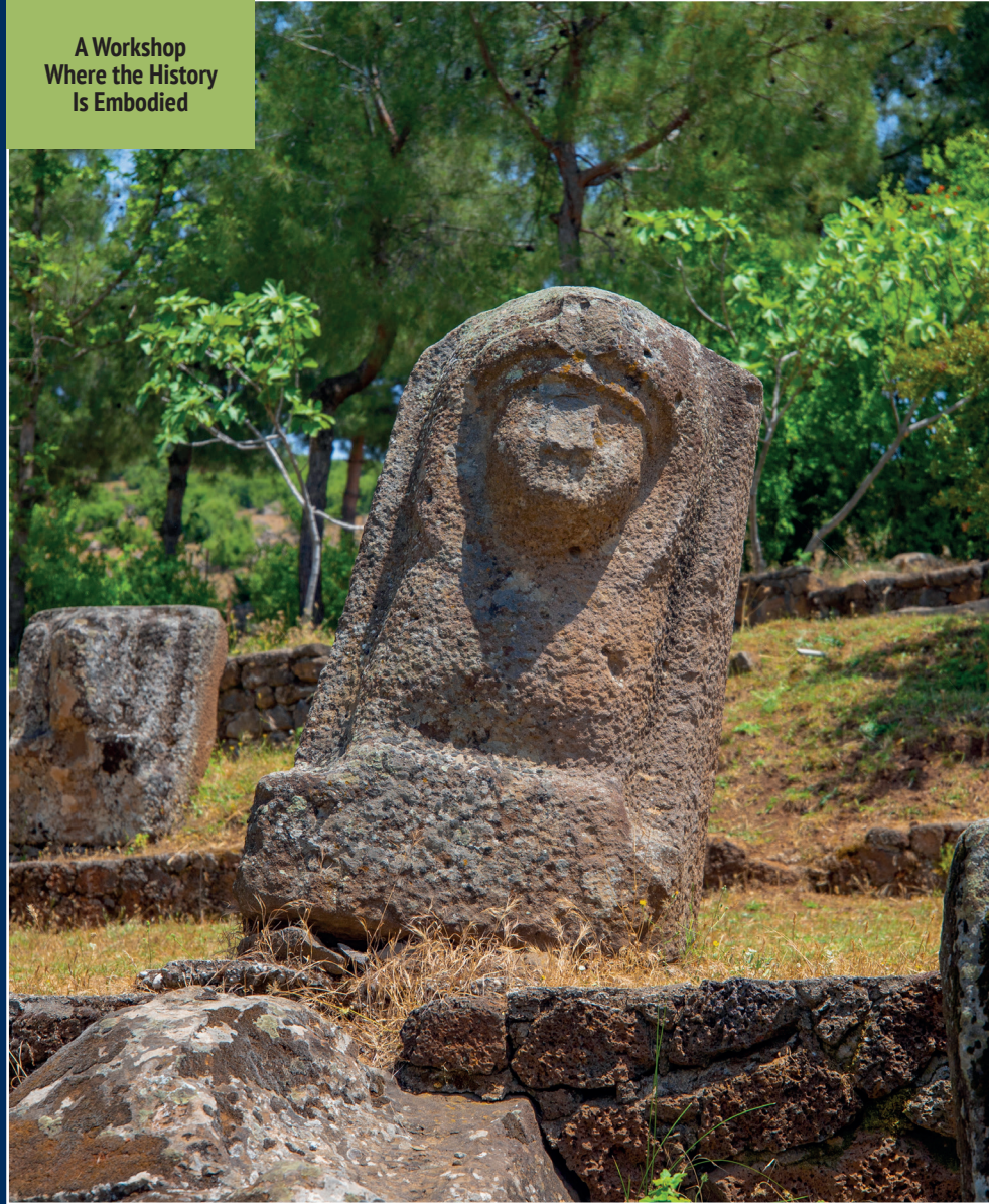
A Workshop Where the History Is Embodied

Yesemek is the largest quarry and sculpture workshop in the Near East between the 14th and 7th centuries BCE. In this sculpture workshop, rich in history, the statues of a lion, a chariot, a bear-man, a winged lion with a woman's head and a miner await their visitors.