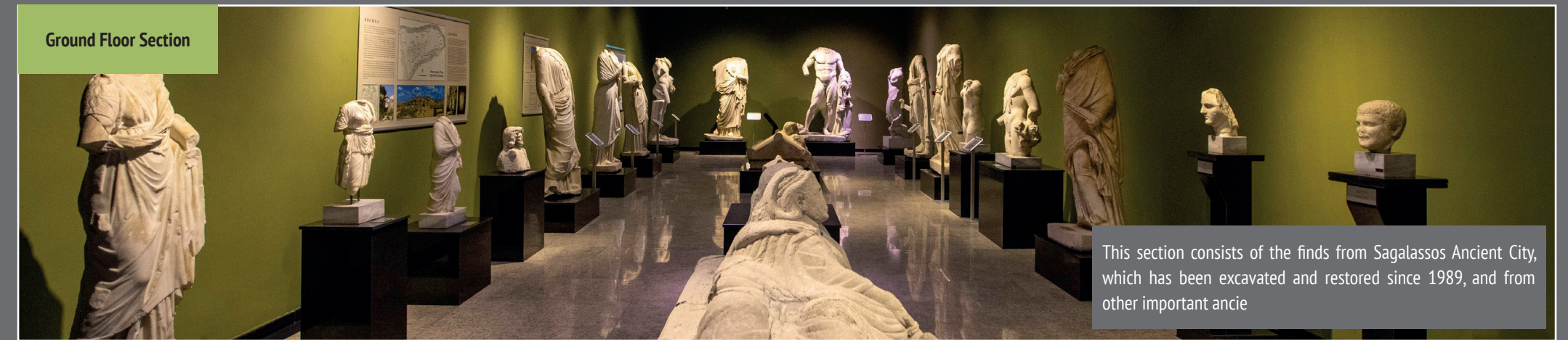
This section consists of the finds from Sagalassos Ancient City, which has been excavated and restored since 1989, and from other important ancie

The showcase, where Bronze-age ceramics from Hacilar Mound, Kuruçay Mound, Höyücek Mound, and Yarım Mound reflecting prehistoric ages, finds from Uylupınar Necropolis, Attica Vessels, Hellenistic and Roman Vessels, Oil Lamps, glassware, metal and bronze items as well as jewelry and coins are exhibited, take visitors on a journey to prehistoric times.