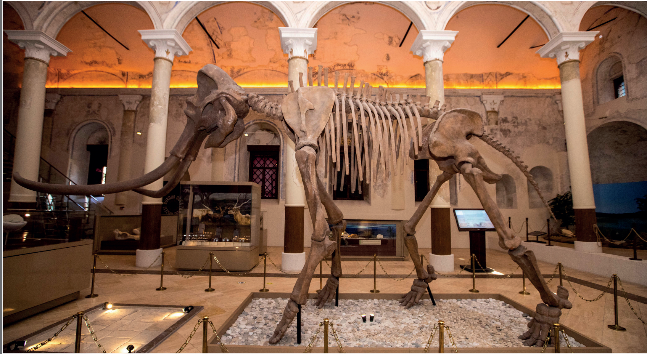
The Burdur basin and the formation at the base of it consist of lacustrine sediments. Swampy areas formed due to tectonic movements within the basin gradually turned into a lake. Elmacik Vertebrate Fossil Bed, located south of this lake, known as Burdur Pliocene Lake, is one of the most productive fossil beds of the Lakes Region.