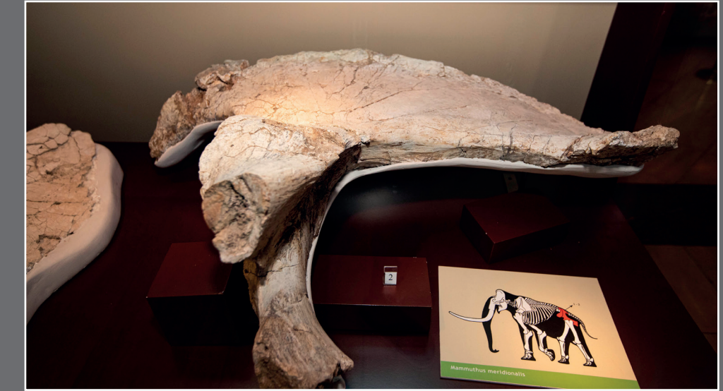
Natural History Museums, one of the scientific and cultural symbols of developed countries, are contemporary educational institutions that collect, archive and exhibit national and local knowledge of natural assets, and where social/cultural and educational activities take place.