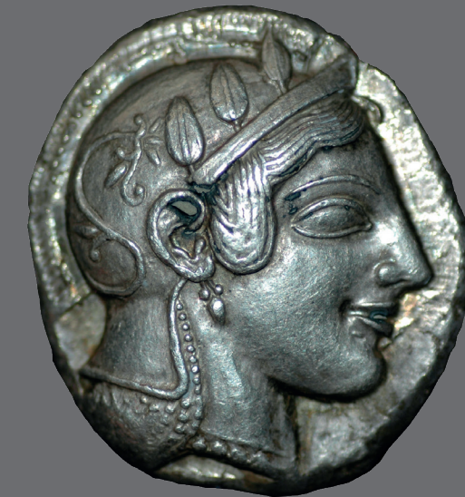
Coins Hall, Artefacts, and Icons

The sculptures of the Roman emperors, all found during the excavations in the ancient city of Perge, are among the masterpieces of Roman art. In addition to the statues of the emperors, the Belly Dancer Statue, which is one of the symbols of the Antalya Museum, is also exhibited here. This sculpture, which was assembled in pieces after its discovery, is one of the most admired works in the museum with its monumentality, fine details and liveliness.