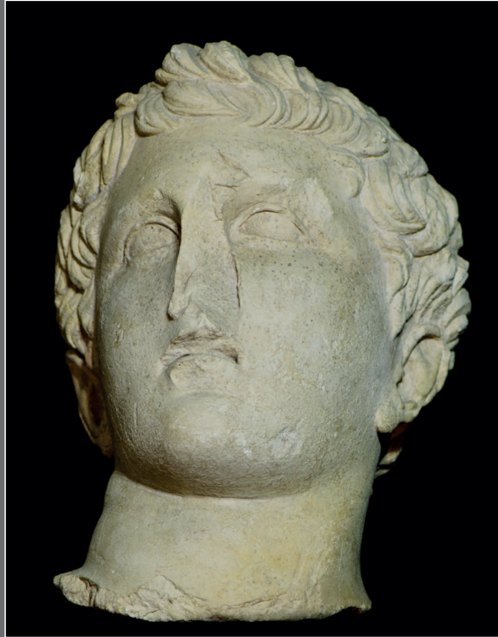
The upper part of the Antiochos statue, which was excavated during the 1985 Samsat excavation, has been preserved. The head is turned slightly to the right, and the hair is depicted as embossed flame segments.