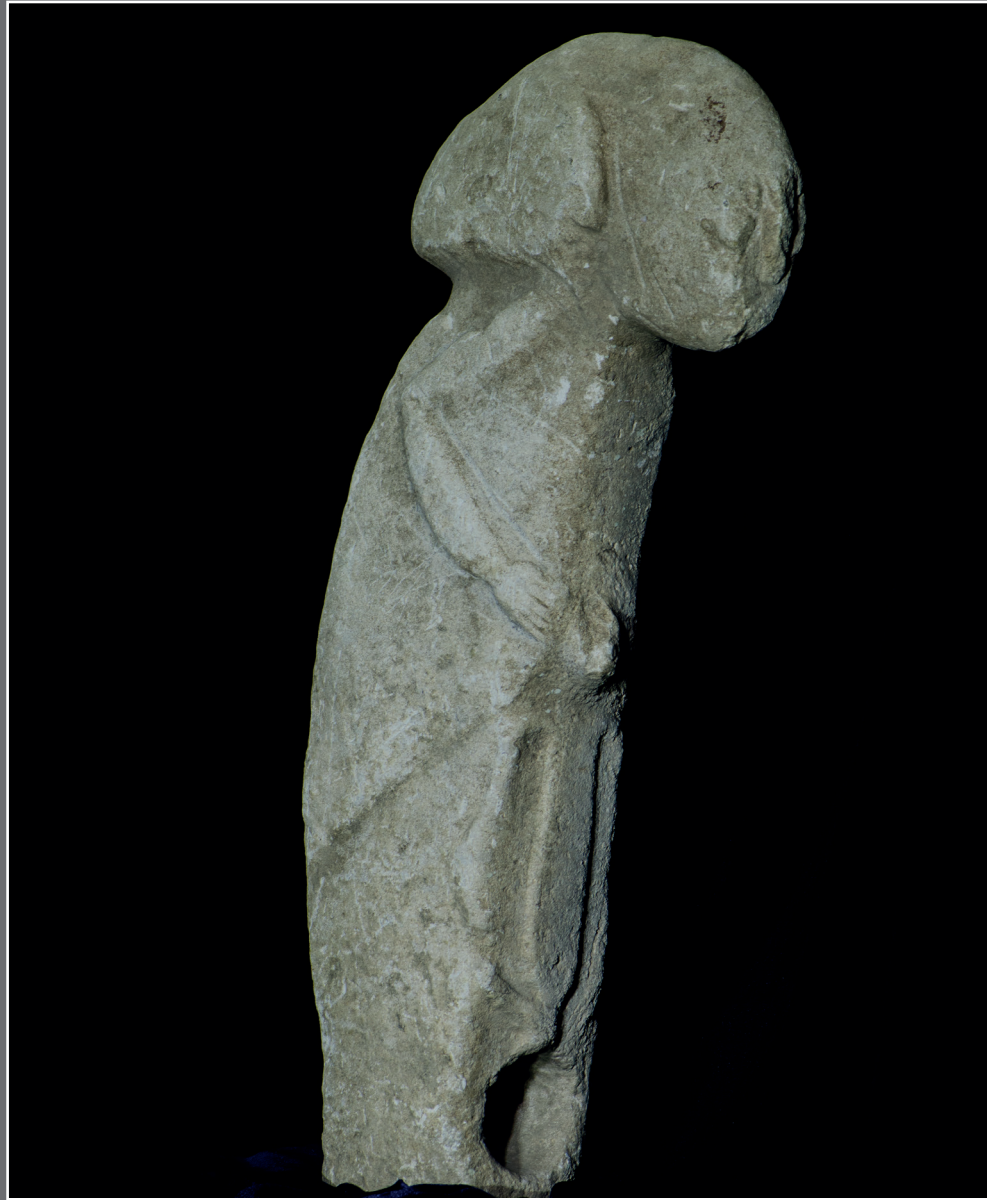
The cult statue found in 1970 in Çıralık Village Kilisik Field in Kâhta district attracts attention because of its similarity to the sculptures in Şanlıurfa Göbekli Tepe. The statue, dated to 7500-7000 BC, was made of limestone. There is a small relief in the shape of a human on the front part of the body where the arms come together. This statue represents a woman or a goddess giving birth.