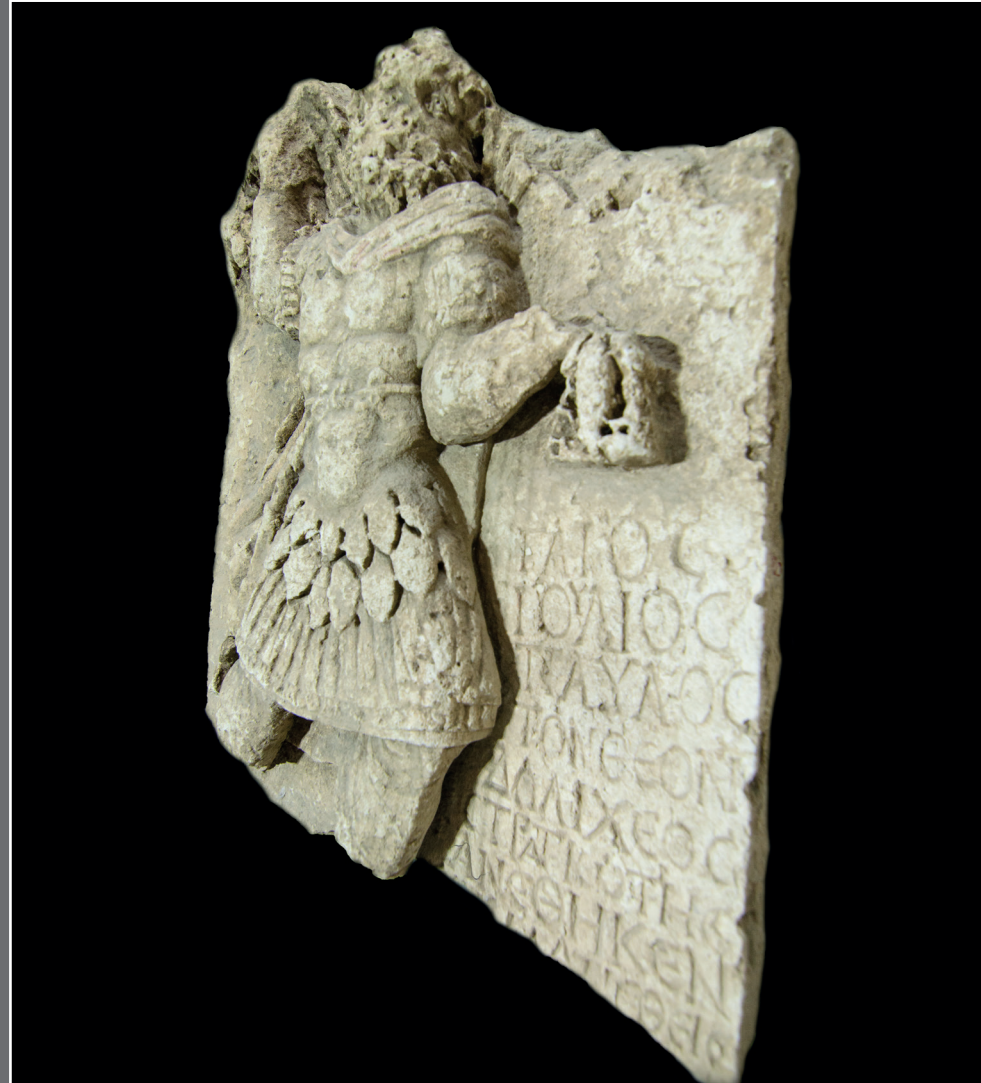
The stele excavated during the excavation of the necropolis Perre Ancient City is a representation of a Jupiter Dolichenus in military dress. The stele depicts Jupiter Dolichenus standing with a curly beard, facing right, holding an eagle in one hand and a thunderbolt in the other, wearing a cloak, breastplate, skirt and boots, and a sword at his hip. The eagle, the upper part of which is broken, is depicted with wings spread sideways. In the lower right corner of the stele is an inscription in Greek in eight lines. According to this inscription, a general named Julius Paulus commissions this relief with the god from whom he believes he has received his help, in his own clothing, to commemorate a victory he has won