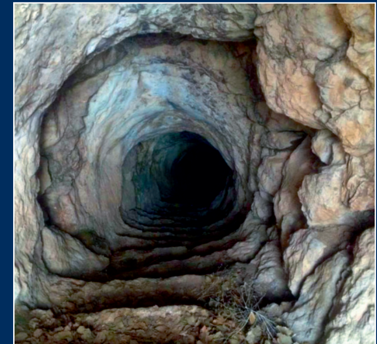
Tunnel with Steps

The tunnel, which is located just below the cult inscription and leads down a steeply sloping staircase, is 158.1 m long. The purpose of the construction of this tunnel could not be clearly traced.