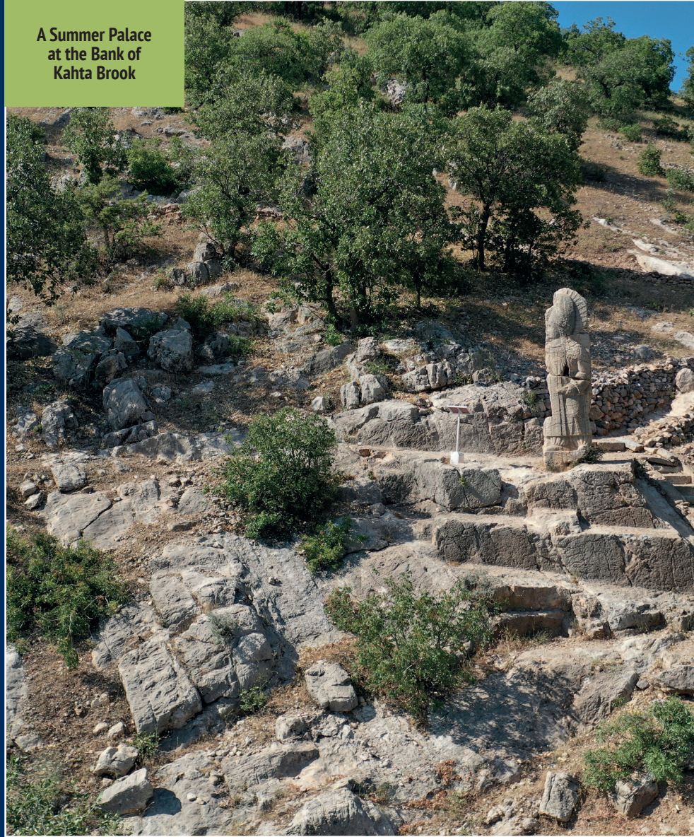
A Summer Palace at the Bank of Kahta Brook

Arsema was the summer capital and administrative center of Commagene Kingdom, which has presented wonderful works to the world heritage it is a junction that reflects the ideal of creating a Greek-Persian culture in which the kings of Commagene had tried to synthesize the Eastern and Western cultures.