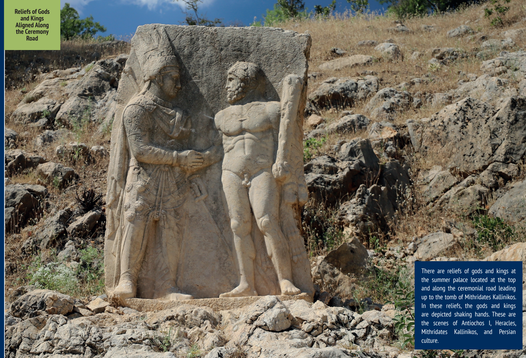
Reliefs of Gods and Kings Aligned Along the Ceremony Road

There are reliefs of gods and kings at the summer palace located at the top and along the ceremonial road leading up to the tomb of Mithridates Kallinikos. In these reliefs, the gods and kings are depicted shaking hands. These are the scenes of Antiochos I, Heracles, Mithridates Kallinikos, and Persian culture.