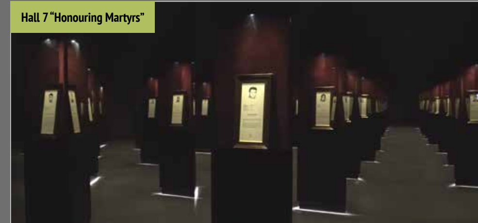
Hall 7 "Honouring Martyrs"