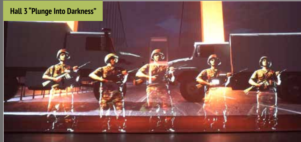
Hall 3 "Plunge Into Darkness"