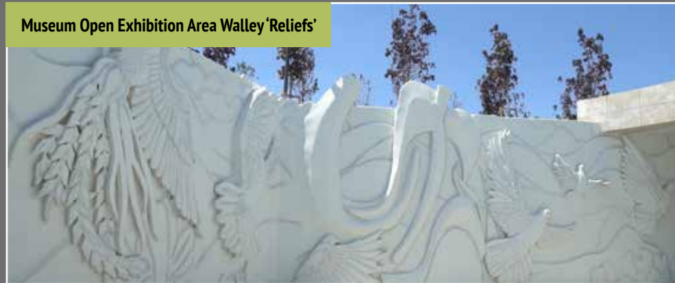
Museum Open Exhibition Area Walley 'Reliefs'